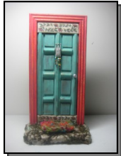
Artist: Holly Kreag Red Trim Door Host: Pineapple House