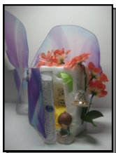
Artist: Kay Cassill Winged Door Host: Merchants Square (display window)